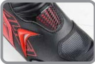
Black/Red Front sides / outsides ventilation system