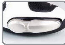
Toe slider replacement