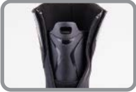
Black Hide for calf protection