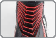
Instep micro-injection with mesh air intake