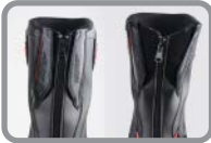
Calf adjustment system