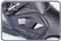
Outsides ventilation system