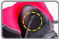
Hide for ankle protection