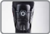
Calf adjustment system