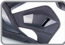
Outsides ventilation system