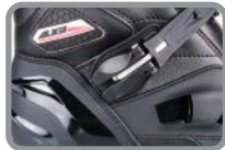
Instep buckle tightening system