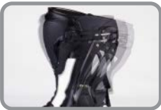
Calf adjustment system